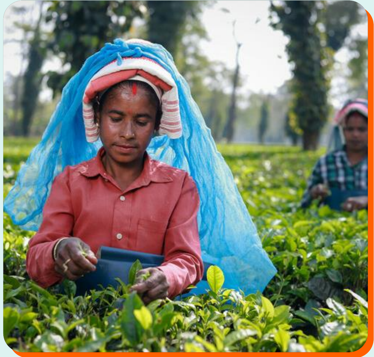
Women picking tea leaves in a tea estate in Assam, India.